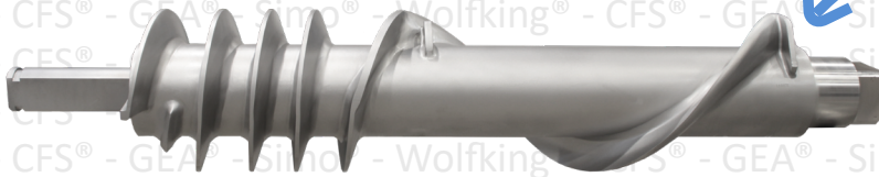
Our most refurbished part.

Did you know we also refurbish worms/augers?