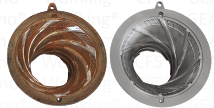
Refurbishment of Simo® lining for grinder before and after.