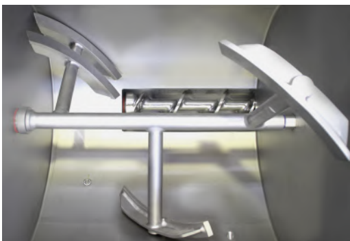
Inside of the 335 litres mixing container.