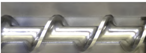
Stainless steel worm/auger with threaded worm pin for easy replacement.

SSMG 300/130 shown with lid closed. Please note the hygienic zone, inspection area between the worm/auger and the gear box. Including grill cover with magnetic switch. Please also note the Allen Bradley operator panel, PanelView AB 800.